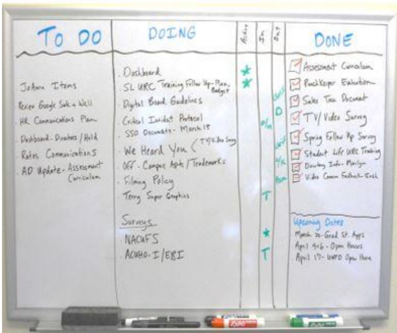
Assistant Director's board